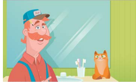
Plumber: ...and we need to have a serious discussion about... Action: Signs into bathroom