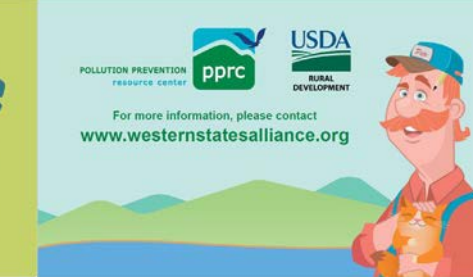
Plumber: Do yourself a favor. Trash the wipes and save your pipes. See you around, neighbor. Action: Plumber patting cat