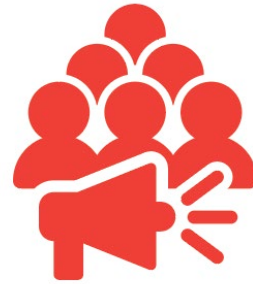
Community-Based Social Marketing