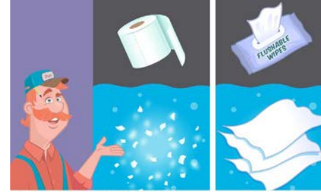
Plumber: ...because they don't break down in the water like toilet paper. Action: Toilet paper breaks apart and disintegrates, while the wipe floats and gets added to one another