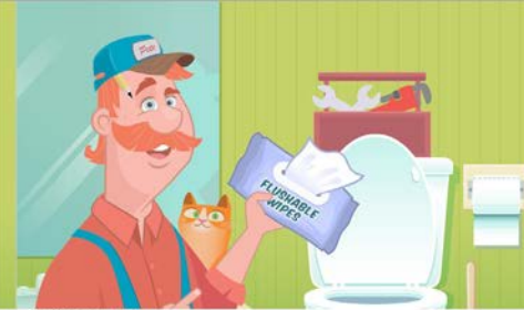
Plumber: ...these so-called... Action: Holds up package of wipes