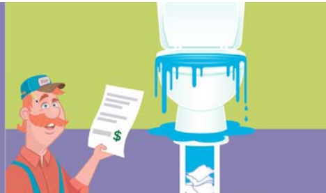
Plumber: Keep flushing those wipes, and you'll be seeing me and one of my non-flushable invoices real soon. Action: The pipe zooms out, showing it connected to an overflowing tank. Plumber holds up invoice.