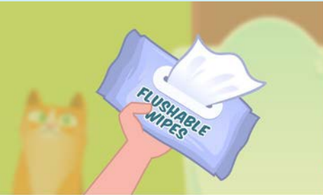
Plumber: ..."flushable" wipes" Action: Holds up package of wipes