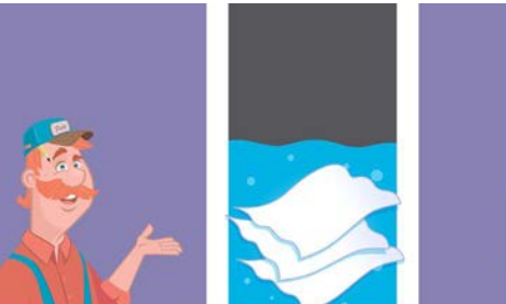
Plumber: If you think you're the exception, think again. Action: The split screen becomes one, transforming into a wipe, just showing the wipes.