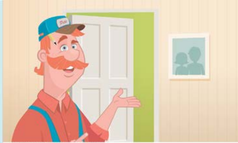
Plumber: Hey neighbor, it's me, Pete, your local plumber... Action: Flushing through bathroom door