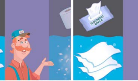
Plumber: ...because they don't break down in the water like toilet paper. Action: Toilet paper breaks apart and disintegrates, while the wipe floats and gets added to one another