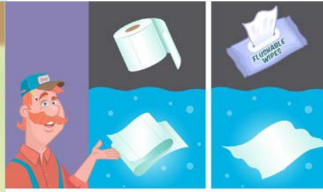
Plumber: The reality is, they're not flushable at all... Action: Shows side-by-side comparison screen of TP vs. Wipes in water