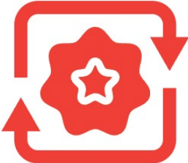
Logo's & Style Guides