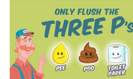
Plumber: To save money, and avoid stress, toss ALL your wipes in the trash. Only flush the 3P's. Pee, poo, and toilet paper! Action: Elements pop onto screen