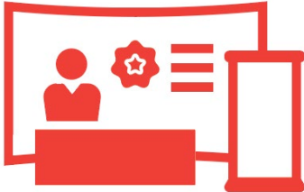
Event Booth Displays